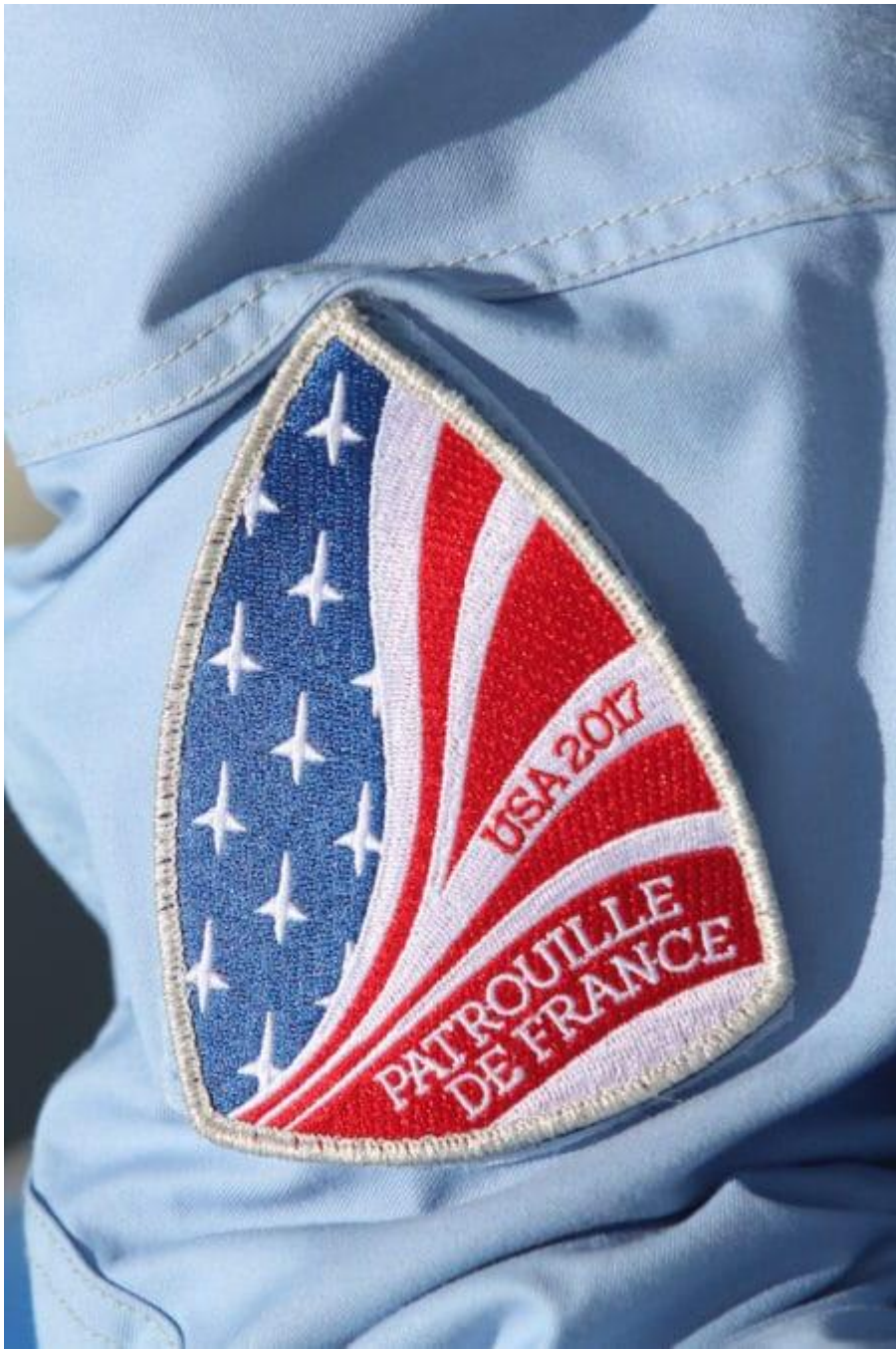
The insignia of the American tour 2017, which takes again the motif painted on the drift of the Alphajet.